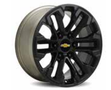
18x8.5-Inch Aluminum Wheel in Gloss Black<sup>3,4</sup> P/N 84641199. MSRP<sup>2</sup>: $500 each.