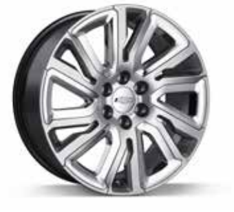
22x9-Inch Aluminum 6-Split-Spoke Wheel in Midnight Silver with Chrome Inserts<sup>3,4</sup> P/N 84799391. MSRP<sup>2</sup>; $550 each.

22x9-Inch Aluminum Multi-Spoke Wheel in Chrome<sup>3,4</sup> P/N 84799388. MSRP<sup>2</sup>: $680 each.