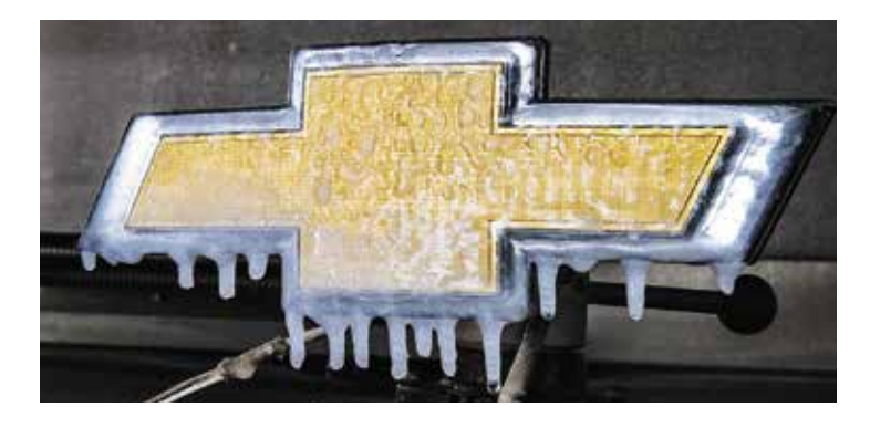
Illuminated Bowtie Emblems feature 100% waterproof construction and are tested to withstand extreme temperatures from -40°F to 158°F.