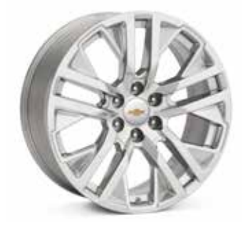
22x9-Inch Aluminum Wheel in Polished Finish<sup>3,4</sup> P/N 84799393. MSRP<sup>2</sup>: $615 each.