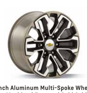
18x8.5-Inch Aluminum Multi-Spoke Wheel in Satin Graphite Machined Face and Gold Oxide Paint<sup>3,4</sup> P/N 84040796. MSRP<sup>2</sup>: $500 each.