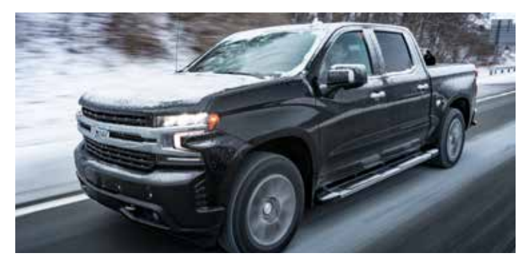
Chevrolet Accessories for Silverado endure cycle tests that include thousands of on/off and open/close cycles.