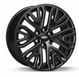
22x9-Inch Aluminum 6-Split-Spoke Wheel in Low Gloss Black with Machined Accents<sup>3,4</sup> P/N 84799390. MSRP<sup>2</sup>: $550 each.