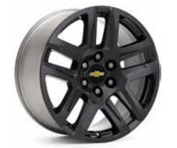
20x9-Inch Aluminum Wheel in Black<sup>3,4</sup> P/N 84799394. MSRP<sup>2</sup>: $550 each.