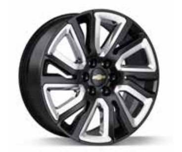
22x9-Inch Aluminum 6-Split-Spoke Wheel in Black with Chrome Inserts<sup>3,4</sup> P/N 84799396. MSRP<sup>2</sup>: $550 each.

22x9-Inch Aluminum Multi-Spoke Wheel in Chrome<sup>3,4</sup> P/N 84799388. MSRP<sup>2</sup>: $680 each.