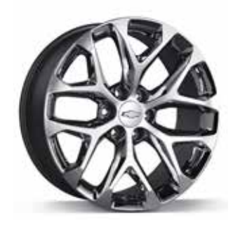
22x9-Inch Aluminum Multi-Spoke Wheel in Chrome<sup>3,4</sup>