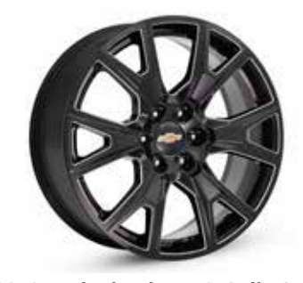
22x9-Inch Aluminum 6-Split-Spoke Wheel in Carbon Flash Metallic with Select Machining<sup>3,4</sup> P/N 84799387. MSRP<sup>2</sup>: $655 each.