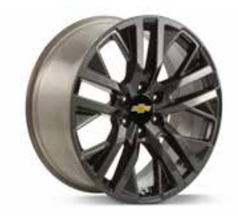
22x9-Inch Aluminum 5-Split-Spoke Wheel in High Gloss Black<sup>3,4</sup> P/N 84799395, MSRP<sup>2</sup>; $645 each.

¹ Composed tire and wheel combinations. See chevrolet.com/accessories for important wheel and tire information or see your dealer. ⁴ Not for use on vehicles featuring the maximum trailering/enhanced towing package.