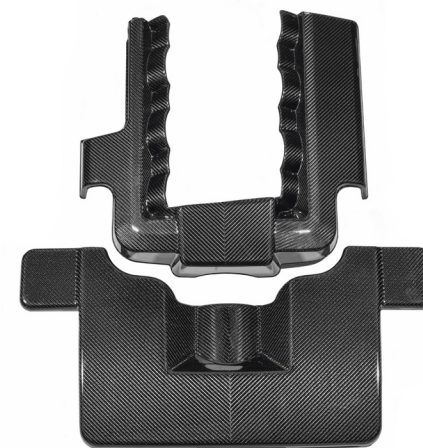
Carbon Fiber Intake and Plenum Cover Set

FOR THE COMPLETE LIST OF CHEVROLET ACCESSORIES, SEE YOUR DEALER OR VISIT CHEVROLET.COM/ACCESSORIES .