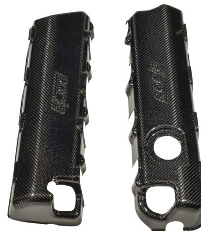
Carbon Fiber Valve Cover Dress Kit