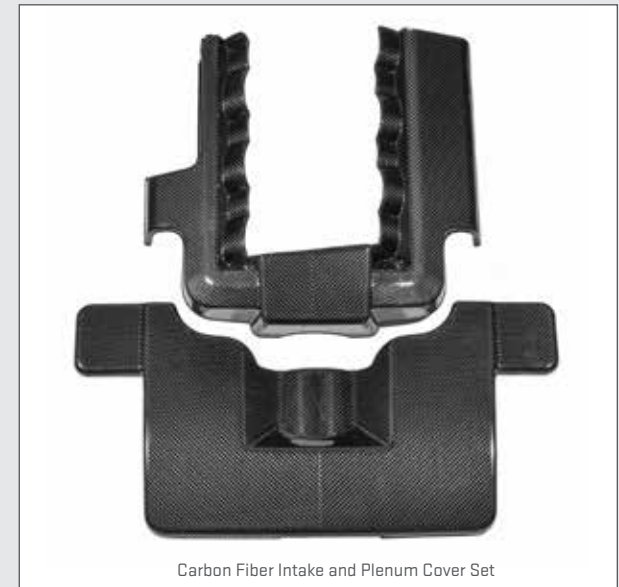
Carbon Fiber Intake and Plenum Cover Set

FOR THE COMPLETE LIST OF GMC ACCESSORIES, SEE YOUR DEALER OR VISIT GMC.COM/ACCESSORIES .