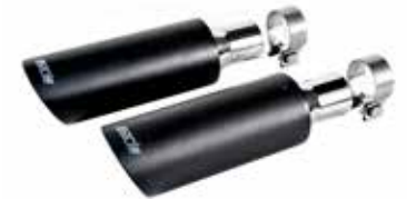
Carbon Fiber Exhaust Tip Kit

FOR THE COMPLETE LIST OF GMC ACCESSORIES, SEE YOUR DEALER OR VISIT GMC.COM/ACCESSORIES .