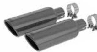
Black Chrome Exhaust Tip Kit