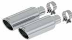
Bright Chrome Exhaust Tip Kit