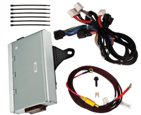
All-New 2019 Silverado 1500 DSP Amp