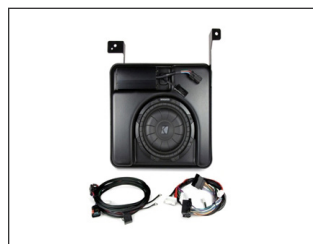
Silverado Subwoofer Kit