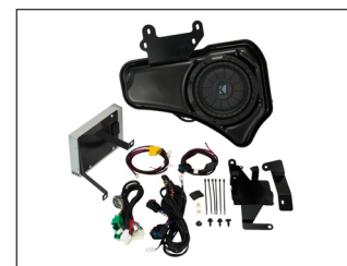
Tahoe/Suburban Subwoofer and DSP Amp Kit