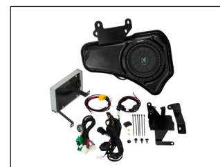
Yukon/Yukon XL Subwoofer and DSP Amp Kit