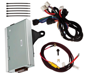
Next Generation 2019 Sierra DSP Amp