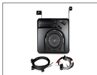
Sierra Subwoofer Kit