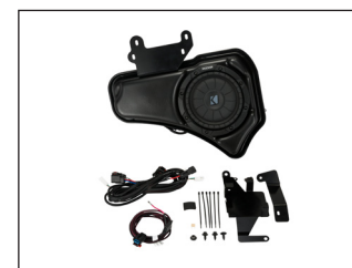
Yukon/Yukon XL Subwoofer