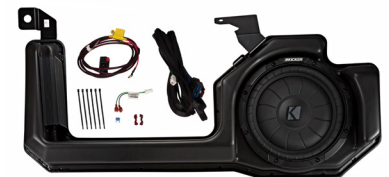
Next Generation 2019 Sierra Subwoofer