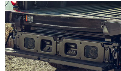
MultiPro™ Tailgate Audio System