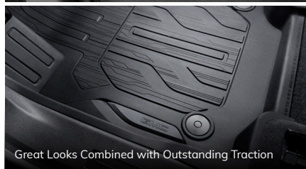
Great Looks Combined with Outstanding Traction