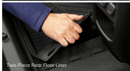
Two-Piece Rear Floor Liner