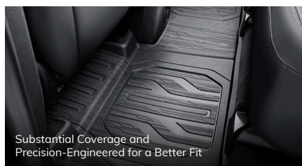
Substantial Coverage and Precision-Engineered for a Better Fit